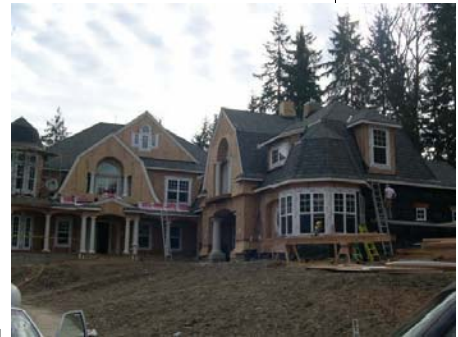
“The Grand Hampton” by Parmenter Homes is taking shape.

2005 Seattle Street of Dreams at Nolan Woods in Woodinville—July 9 to August 14