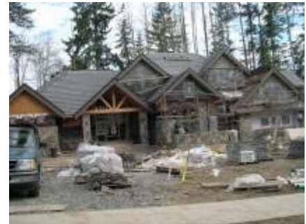
Gregerson 2005 Show Home Under Construction

What attracted you to the building business? The individual challenges faced on each project along with the ability to visualize something, put it together, and see it as a finished working product.