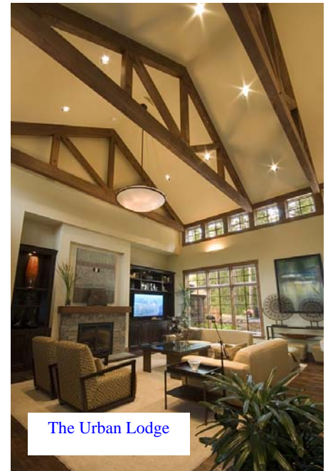
The Urban Lodge