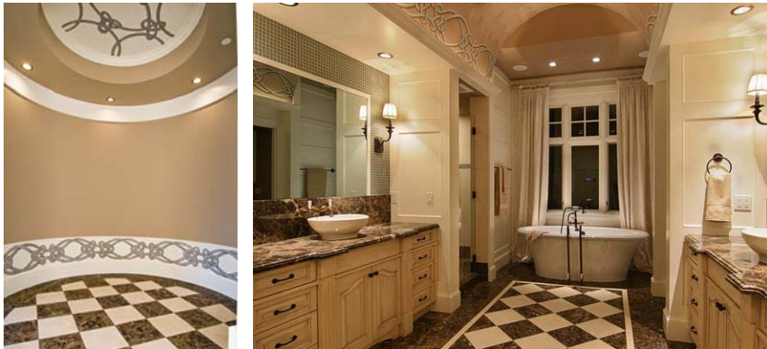
Celtic Knot Details in Master Bedroom Entry & Master Bathroom of 2006 "Kensington Manor"